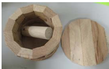
Geoff Pinkerton 'Unfinished' Silk Oak