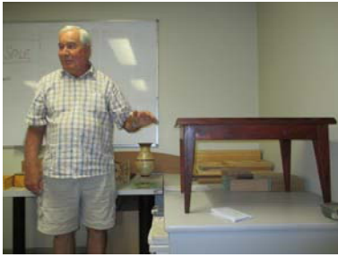
Perrie Bullock Coffee table, recycled Black wood and Red Gum